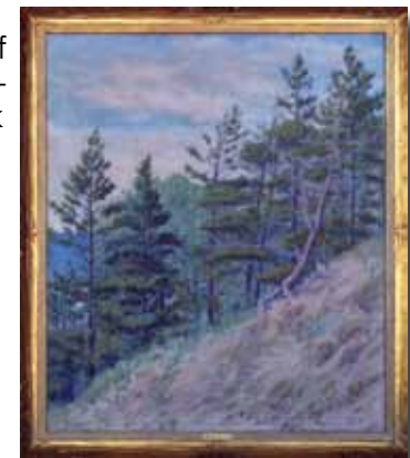
Title 'The Dunes'

If you are interested in hanging some of the collection in your business, please call the MAI office at 231-723-2682 and arrangements can be made. Individuals who have art works they wish to donate to the permanent collection may call the office and the MAI Acquisition Committee would be pleased to have them to add to our collection.